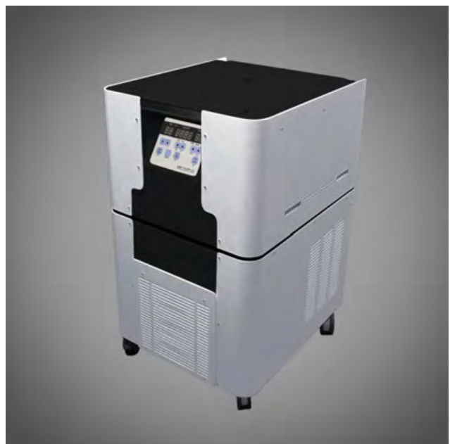
BE with trolley