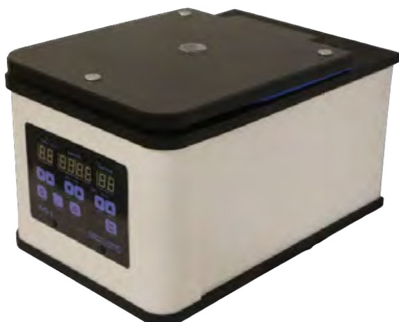
Display indicative only